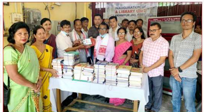
Inauguration of Library Unit in Lakhimpur Jail : The L.T.K. College inaugurated a Library Unit in Lakhimpur Jail on 24/07/2022