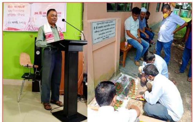
45th College Foundation Day on 22/08/2021