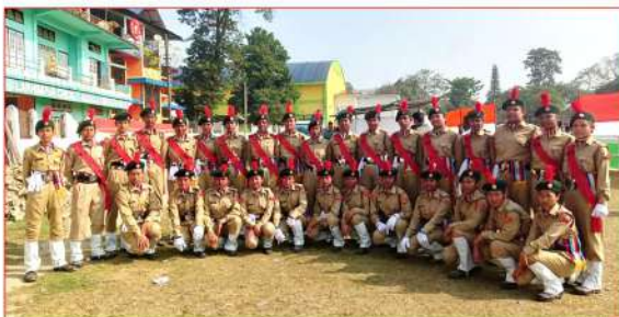
L.T.K. College NCC Unit, participation in the Republic Day Parade, 26/01/2023 Celebrated by the Lakhimpur District Administration

National Cadet Corps is a Tri-services organization comprising the Army, Navy and Air force engaged in grooming the youth of the country into disciplined and patriotic citizen. It is a voluntary organization which recruits is planning to introduce N.C.C from this session Application those are cadre of NCC will get extra preference in admission.