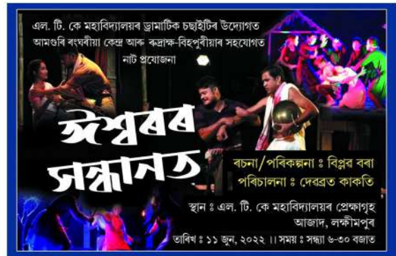
The L.T.K. college, Dramatic Society under the banner of Amguri Rangharia Bihpuria a programme on importance of Drama, "Ishwaror Sandhanot" was organised in the college auditorium on 11/06/2022

In the year 2017 the teaching faculties and students of the college with due permission of the college authority formed the L.T.K. College Dramatic Society with the aim of nurturing the dramatic talents of the students as well as providing the students with a platform to showcase their talents. The society has already dramatized two plays in the college auditorium and conducted one workshop on Acting and Stage Performance in collaboration with NSD, Siliguri for the benefits of the students.