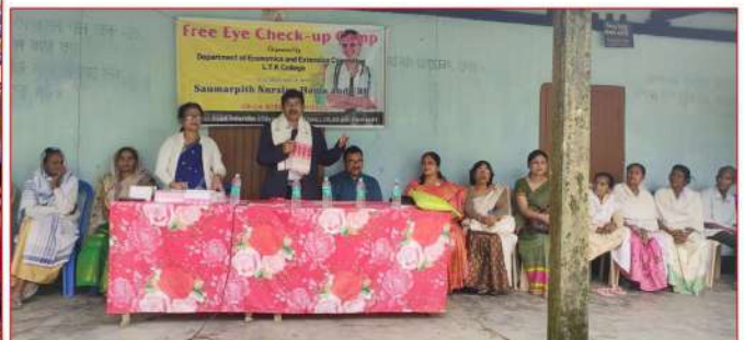
Blood Donation Camps and Free Eye Check Up Camp at Kalita Gaon on 09/04/2022